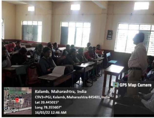
Respected Faculty Addressing the program