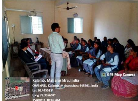
World Mental Health Day Celebration