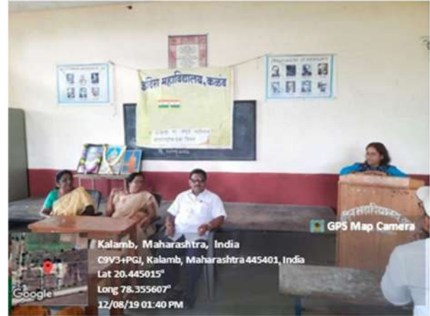
Celebration of Yuva din