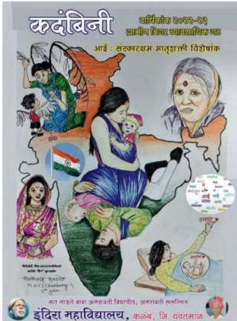
College Magazine Cover Page

Our college magazine for 2022-23, themed “Aai Sanskarksham Matrushakti,” won the 2 nd prize at the university level. This accolade honors our insightful exploration of mothers as pivotal figures in nurturing and preserving cultural values. The magazine features essays, personal stories, poetry, and art that celebrate the profound impact of maternal strength and wisdom on individual and societal growth.